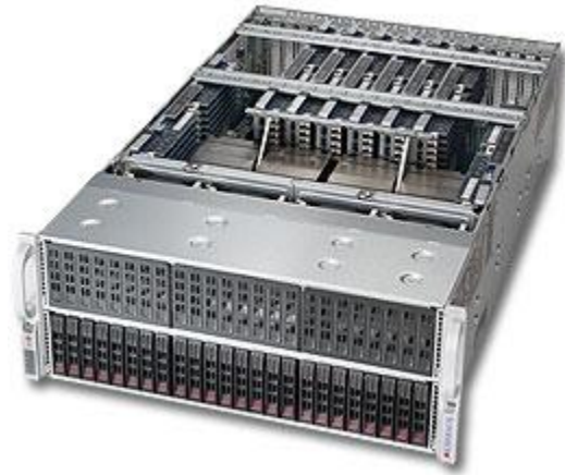
Figure 3 - SuperServer 4048B-TRFT

Stanford will be able to scale out their seismic algorithms, filters and research to even larger datasets using the 6 TB of DDR3 memory capacity offered on SuperServer 4048B-TRFT.