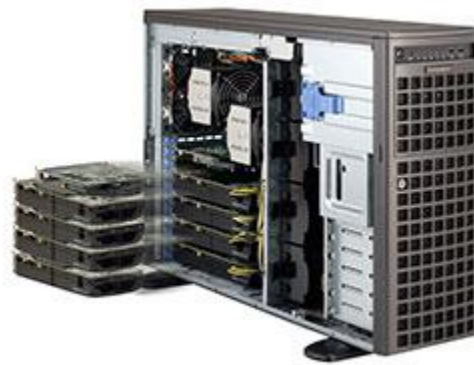
Figure 2 - 7047GR-TRF

Draganov, 2009) to extract body waves to construct 3D seismic velocity with tomography (Hole, 1992). Typically, active sources must be used to obtain subsurface images but using Superworkstation 7047GR-TRF (1 TB of DDR3 memory capacity and 48 cores) Stanford was able to apply new body wave extraction filters and algorithms to the very large seismic datasets. This is the first application of body-wave tomography in the regional scale (~10 km) ambient noise. The ambient noise is recorded by a dense and large network (figure 2) which has about 2500 receivers with 100-m spacing. The data size is over 50 TB because it is from continuous recording and requires both computational speed (48 cores) and very large DDR3 memory capacity (1 TB) to analyze it.